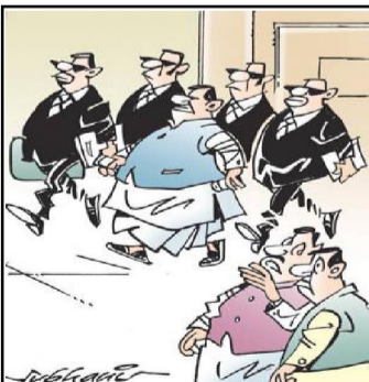
Those men in black guard his black money!